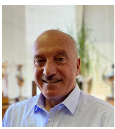
Dear Sport Friends,

I would like to welcome you to the European Aquatics Youth Artistic Swimming Championships 2024, which will take place in Athens,